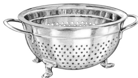
colander or steam basket

USE TO: Rinse fresh fruit and veggies, or thaw frozen ones. Drain pasta. Steam vegetables.